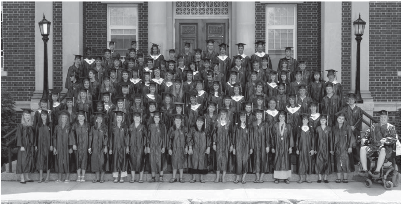
Class of 2007 Graduates